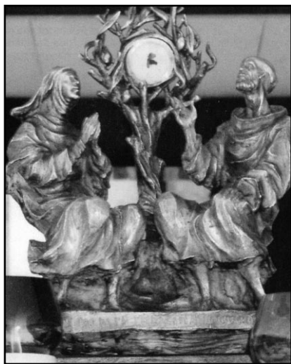
The reliquary containing dried blood from the stigmata of Padre Pio was placed beside the Papal Altar during the Canonization Mass, June 16, 2002.

On June 16, 2002 in one of the largest liturgies in the Vatican's history, Pope John Paul II canonized Padre Pio before a crowd of 300,000 people. During his homily he recalled how, in 1947, as a young priest he made a pilgrimage to San Giovanni Rotondo to make his confession to Padre Pio. "I, too," said the Pope, "had the privilege in my younger days, of taking advantage of his availability in penance."