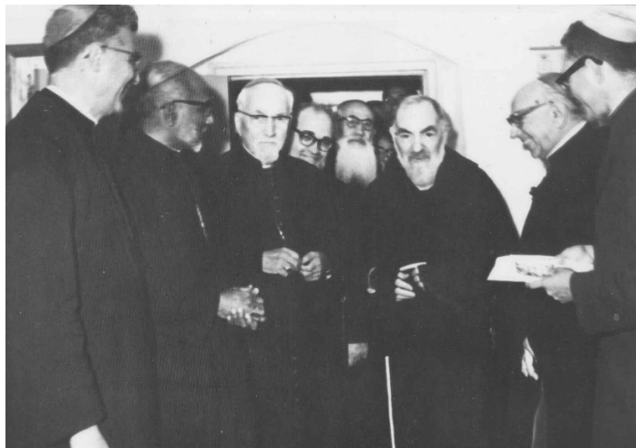
Many bishops from the Second Vatican Council visited Padre Pio