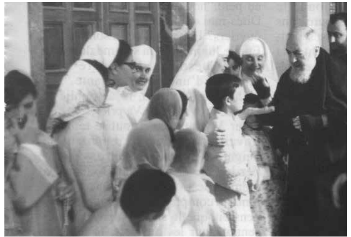
Padre Pio greets some of the children who are patients at the Home for the Relief of Suffering