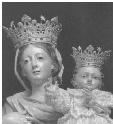
Our Lady Liberatrix Patroness of Pietrelcina